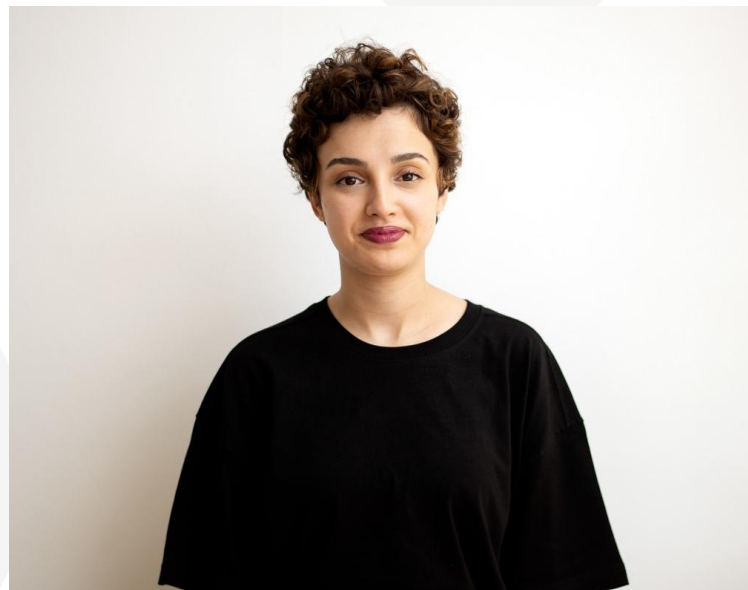
PHOTO 2 PORTRAIT