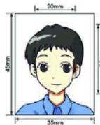
Unqualified Sample Images: