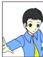
Daily life Photo