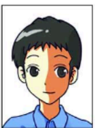
Shadow over the face