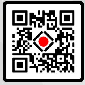
ITC WEEK 2 TRAINING BOOKING

International Training Camp will be held at the KODOKAN (Monday 04 – Friday 15 December 2023). The training camp will be organised for two weeks (Week 1 and Week 2) as below: Athletes participating in WEEK 2 who do NOT stay at an official hotel (booked through the organizer) are required to submit a web form: https://form.run/@ITCWEEK2