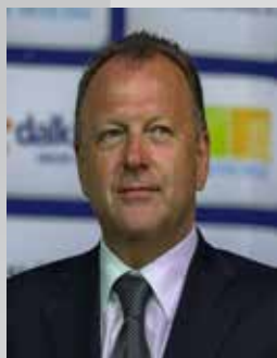
Marius L. VIZER President International Judo Federation