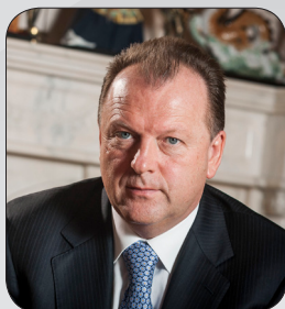
Marius L. VIZER IJF President